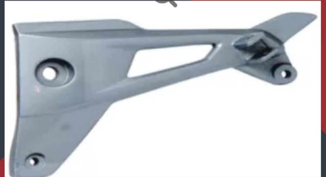
Foot rest holder manufactured us (Frontside)