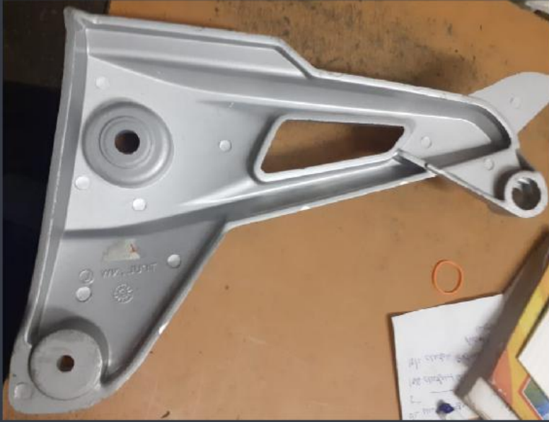
Foot rest holder manufactured us (backside)